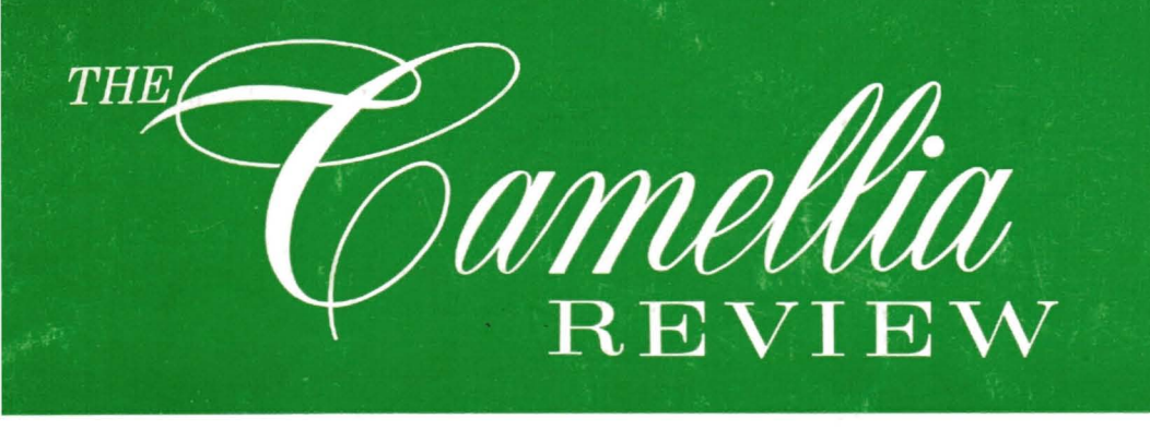
A Publication of the Southern California Camellia Society