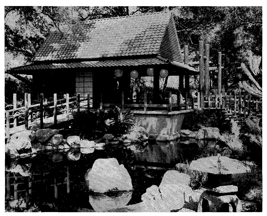
Tea and cookies from 11 A.M. to 4 P.M.

The Descanso Gardens Teahouse is an example of what can be done in (Continued on Page 24)